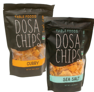
Table Foods Dosa Chips Gluten Free 5 oz.