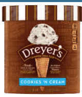
Dreyer's Ice Cream 1.5 qt.