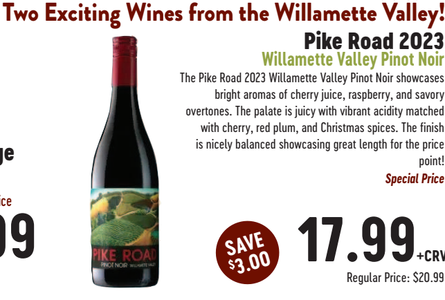
Pike Road 2023

Willamette Valley Pinot Noir The Pike Road 2023 Willamette Valley Pinot Noir showcases bright aromas of cherry juice, raspberry, and savory overtones. The palate is juicy with vibrant acidity matched with cherry, red plum, and Christmas spices. The finish is nicely balanced showcasing great length for the price