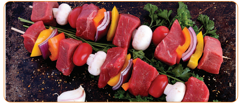
Marinated Teriyaki Beef Kabobs Made fresh at Draeger's.