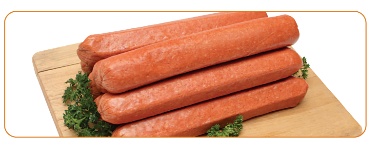
49ers All Beef Franks Great for BBO!