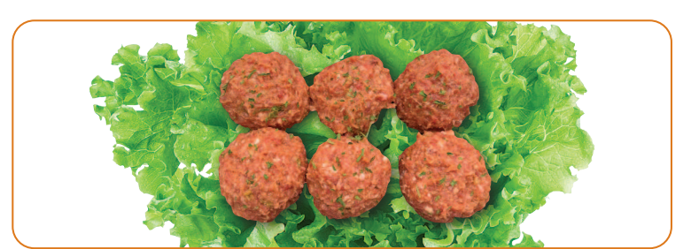
Fresh Meatballs Made fresh at Draeger's.