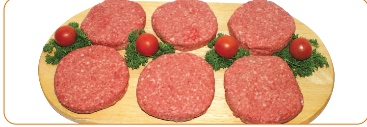
Beef Seasoned and Plain Patties