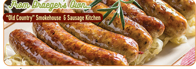
Italian Sausage Hot or Mild.