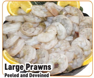
Mild sweet flavor. Tender when cooked