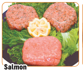
Patties Made at Draeger's!