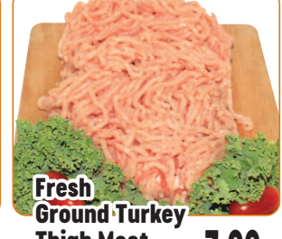
Thigh Meat Ground fresh daily!