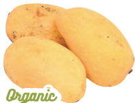
Organic Ataulfo Mango Enjoy tropical treat, excellent flavor

Sign up for our Monthly Emails and Receive Valuable Coupons! When you add your name to our email list you will instantly receive $15 in coupons. Each month you will receive more! Learn about new product features and Save on produce, wine and cheese! Go to: www.draegers.com